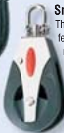
Fig. 2: Under low load, the ratchet pawl disengages allowing the sheave to spin freely.